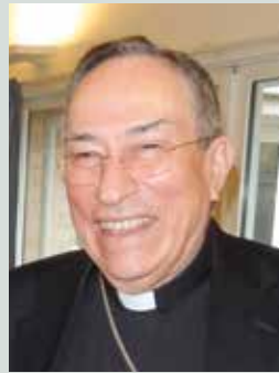
Cardinal Oscar Rodriguez Maradiaga, Archbishop of Tegucigalpa, Honduras

ASMOAF hosts a number of overseas visitors and in the past year they have included: